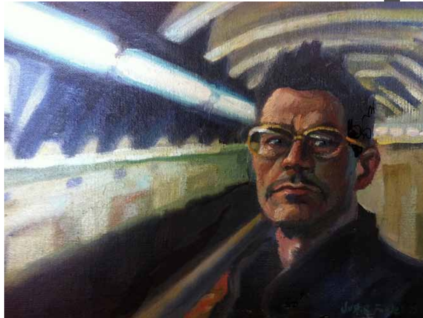
"Self-portrait" at Train station