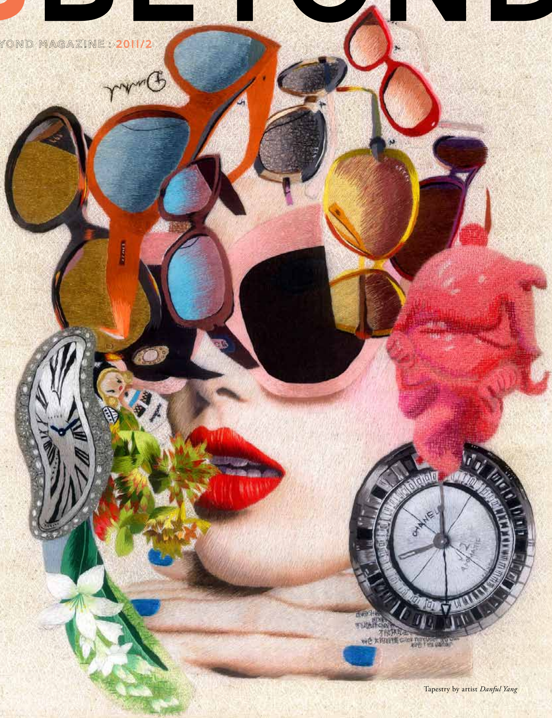
Tapestry by artist Danful Yang