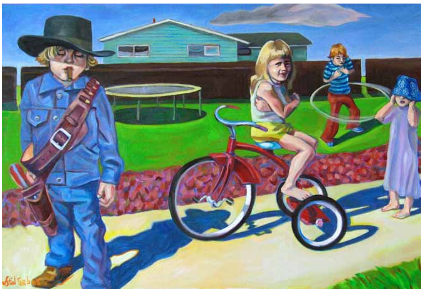
"McQueens' Blvd." 24"x36" oil/canvas 2010