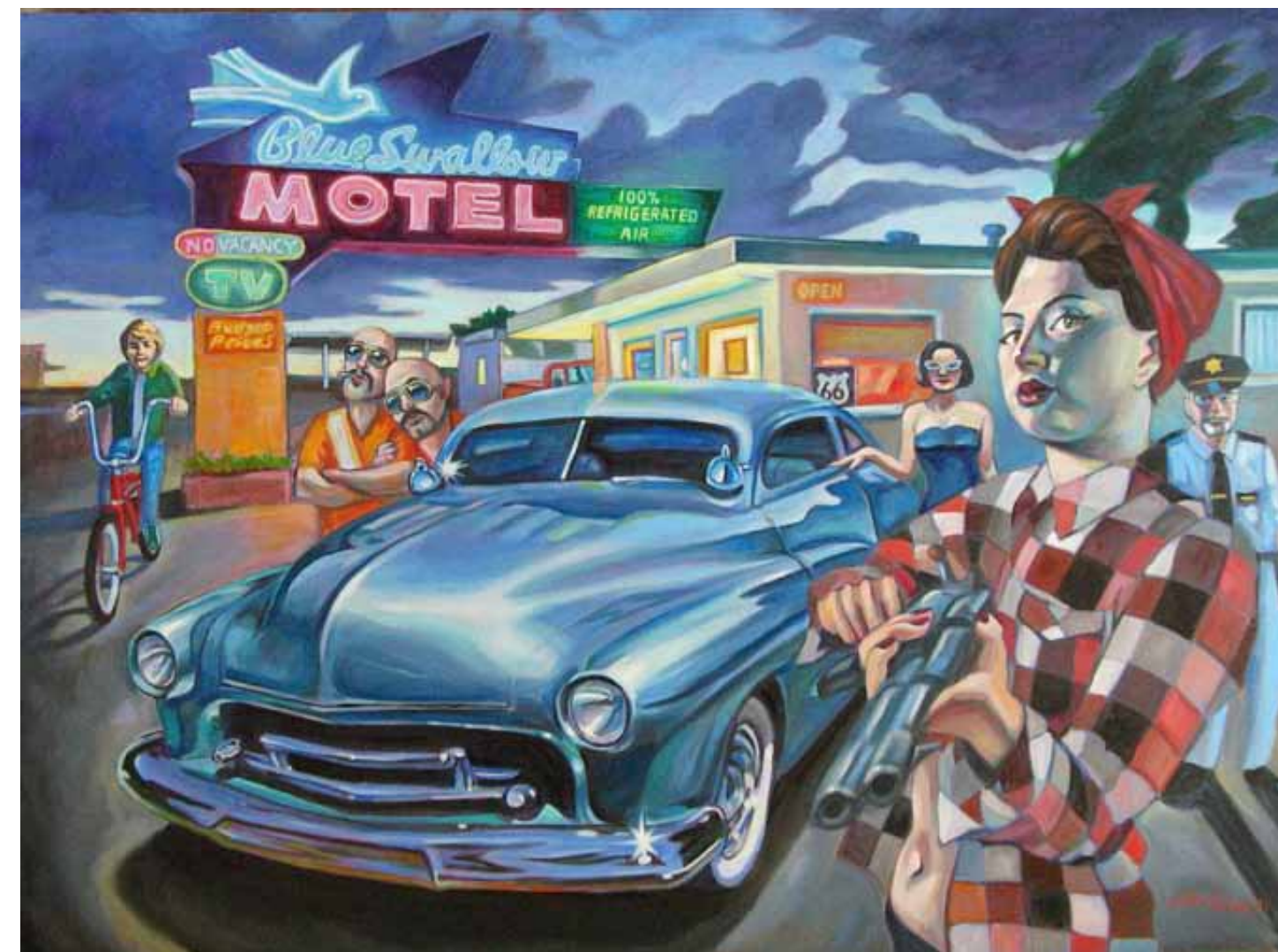
“Happiness is a Warm Gun” 36” x 48” oil/canvas 2011